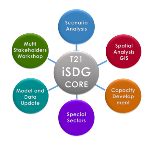
Figure 1: Integrated Sustainable Development Goals (iSDG) model

The iSDG model enables decision-makers to use system dynamics thinking and tools to analyze and understand the interconnectedness between social, economic, energy, and environmental factors. It also handles macro analysis of economic, social, and environmental development challenges, and understanding of the complexity of and interrelationships among policies in each sector. The development and use of iSDG models in many countries have helped to create greater and more open dialogue among stakeholders in the formulation of country and regional policies. The iSDG model supports looking into alternative future scenarios compared to the business as usual scenario, and make informed choices on a way forward that optimize the synergies and minimize or mitigate the unintended consequences of policy decisions.